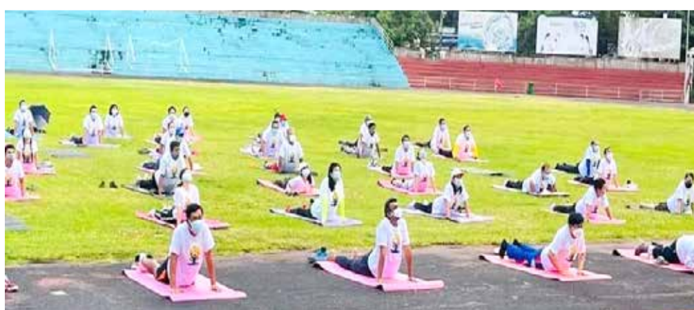
Celebration of International Day of Yoga on 26 June 2021 in Vientiane.