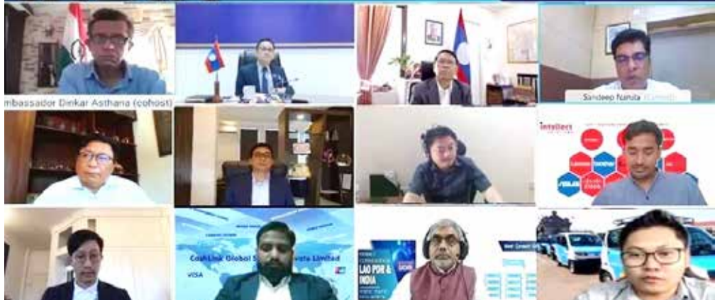
Webinar and Business to Business Networking Meeting to enhance cooperation in ICT sector between Lao PDR and India on 12 May 2021.