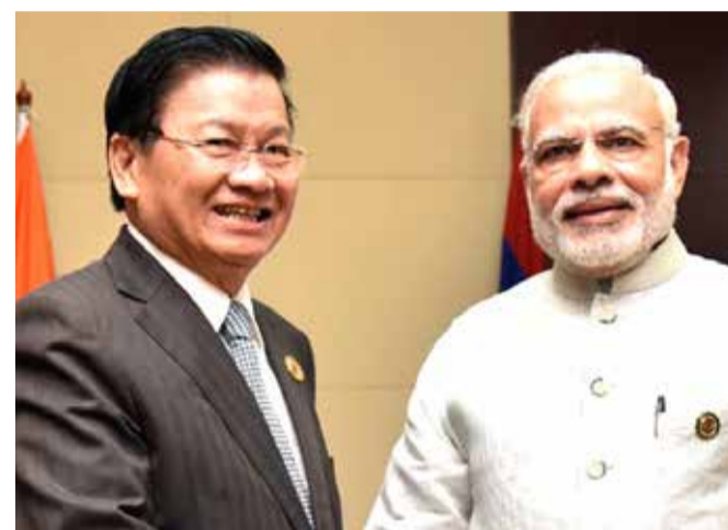
Meeting of Prime Minister of India H.E. Mr. Narendra Modi with the then Prime Minister of Lao PDR H.E. Dr. Thongloun Sisoulith (Vientiane, September 2016).