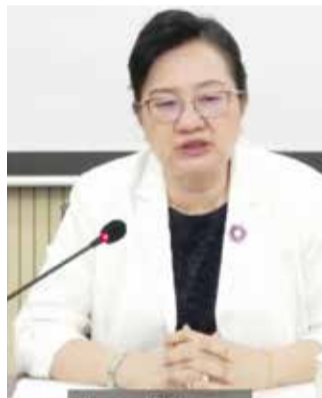
The then Minister of Industry and Commerce of Lao PDR, H.E. Ms. Khemmani Pholsena virtually addressing the 6th India-CLMV Business Conclave organised by Confederation of Indian Industry (CII) on 03 December 2020.