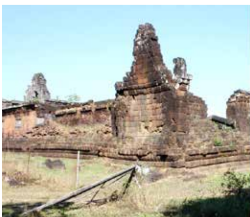
Southern Quadrangle of Vat Phou Temple