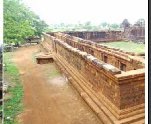
Northern Quadrangle of Vat Phou Temple After restoration