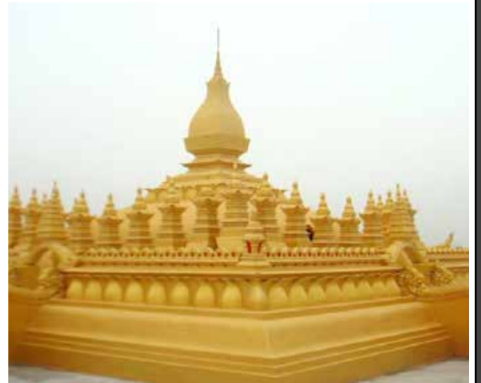
Vat Lao at Bodh Gaya (Buddhagaya) India (Monastery of Laos).