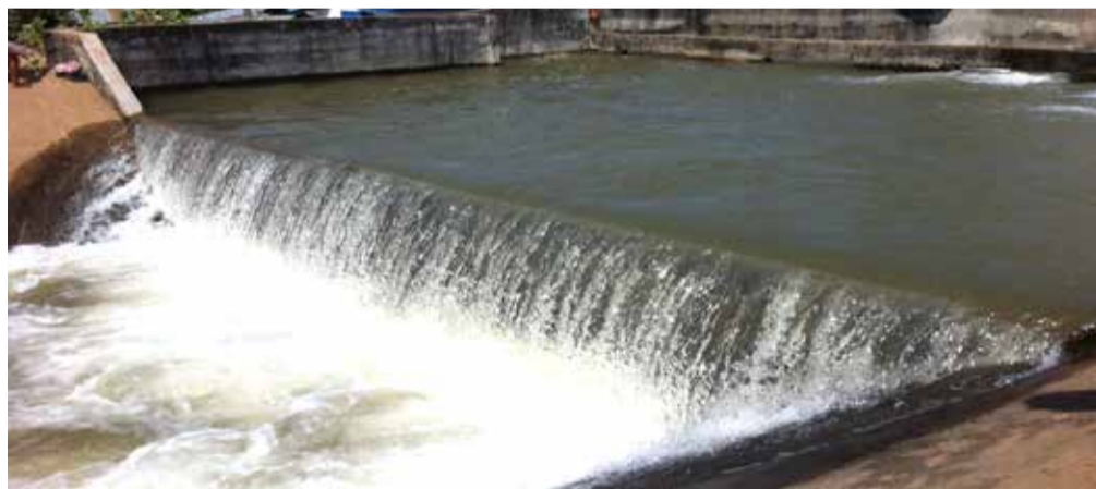
Somhong Irrigation Scheme in Champassak Province – built with Line of Credit from India.