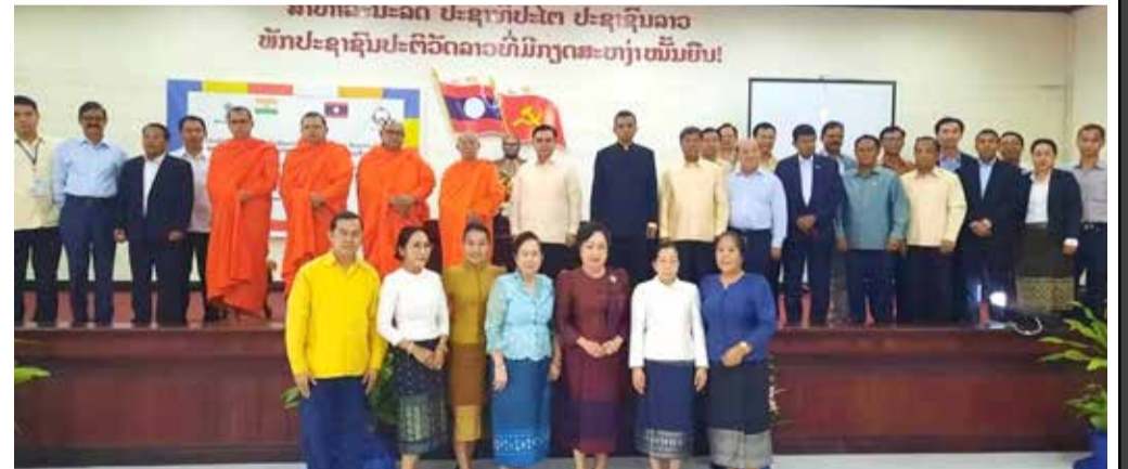
Talk on "Buddhist Linkages between Lao PDR and India" at the Headquarters of Lao Front for National Development (Vientiane, 12 March 2021).