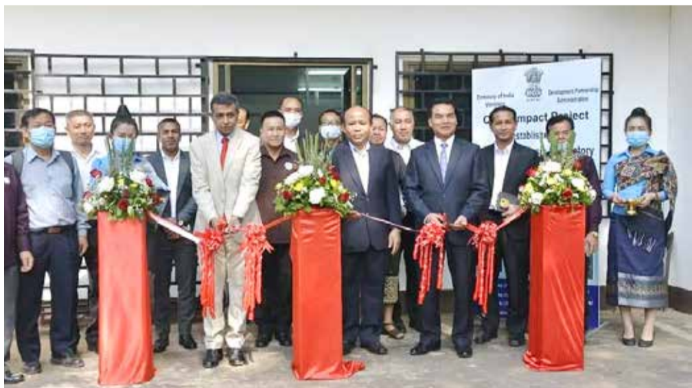
Handing over Ceremony of the Quick Impact Project 'Establishment of Fertilizer Analysis Laboratory' on 12 April 2021.